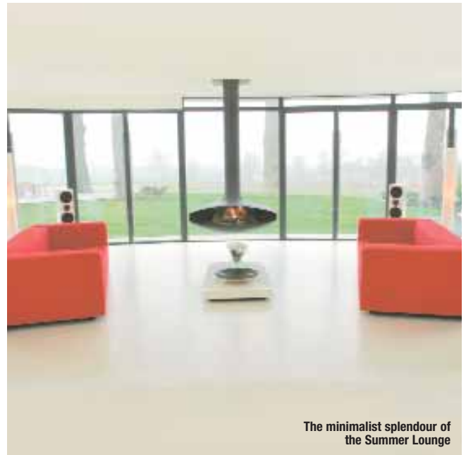
The minimalist splendour of the Summer Lounge

To cater for the tower's expansive dimensions an eight-zone system, with one additional sub-zone, was the order of the day. Making up the main system hub is a Knekt KIVOR INDEX, providing the necessary eight outputs and music library with enough capacity to store 500-hours of the family's favourite tracks, a Knekt KIVOR LINNK (the control interface), a PEKIN tuner and the Knekt INTERSEKT R8S8 audio switching matrix. This