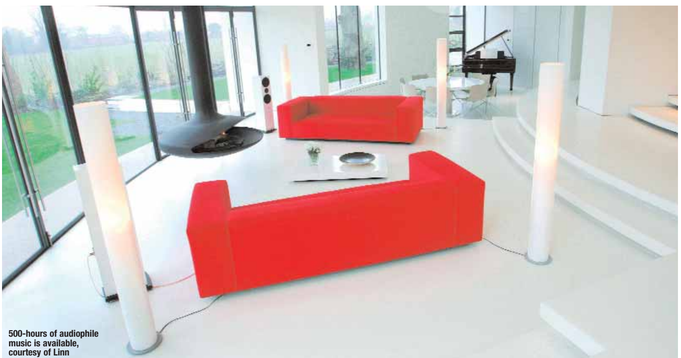
500-hours of audiophile music is available, courtesy of Linn