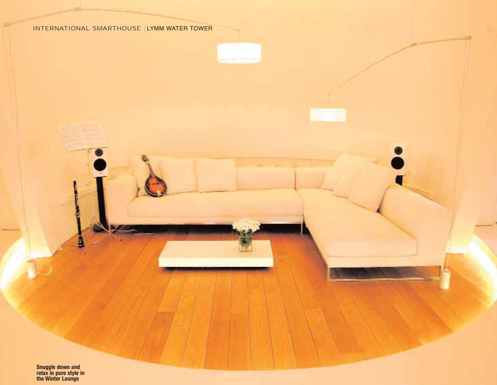
Snuggle down and relax in pure style in the Winter Lounge